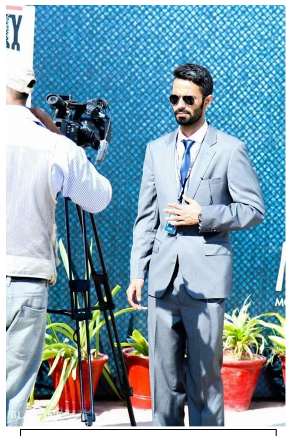
DAWN News-Conference Coverage